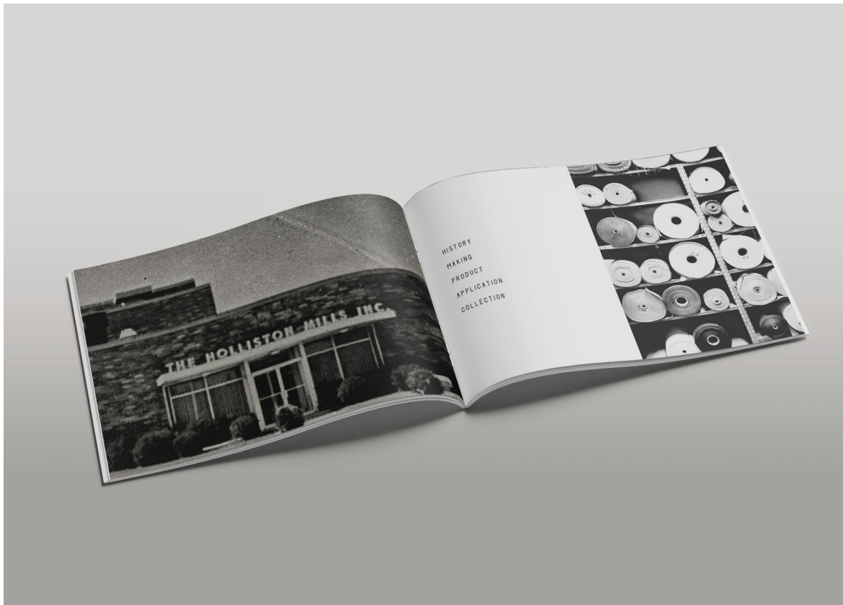
ENVELOPE BOOKLET - HISTORY ON HOLLISTON